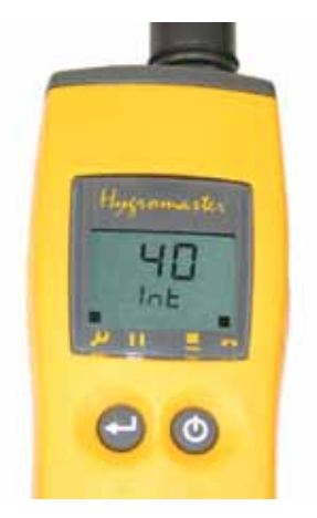
Set interval 1 minute to 24 hours