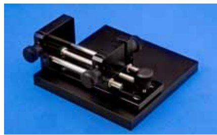
Holder for single fibres FHO 4oplus