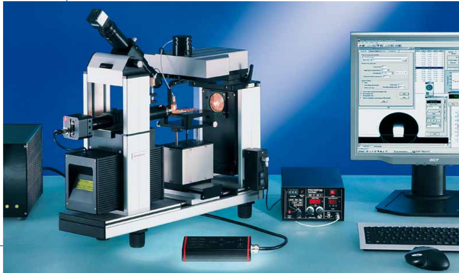
OCA 40 Micro with high-speed image processing system UpHSC 2000, top view video system and electronic picoliter dosing system