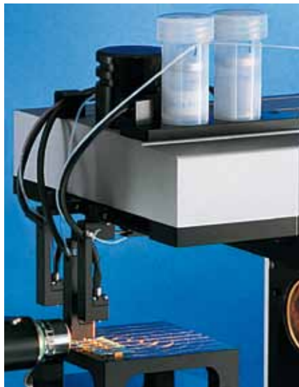
Nanoliter dosing systems

The micro system and nanotechnology are en vogue since several years. In many new technical applications the wetting behavior of micron size liquid drops or even tinier droplets on solids affects the quality of recent products and the related production processes. Wetting and de-wetting on a very small scale play a key role frequently. In particular the biotechnology and the genetic engineering profit already significantly from the latest progress and improvement in this exciting area of science. State-of-the-art optics, precise mechanics, fast electronic controllers as well